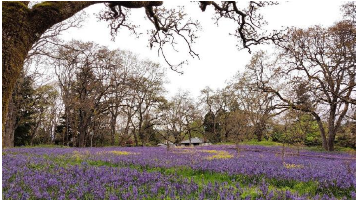
Camas meadow at Playfair Park, Saanich, BC.