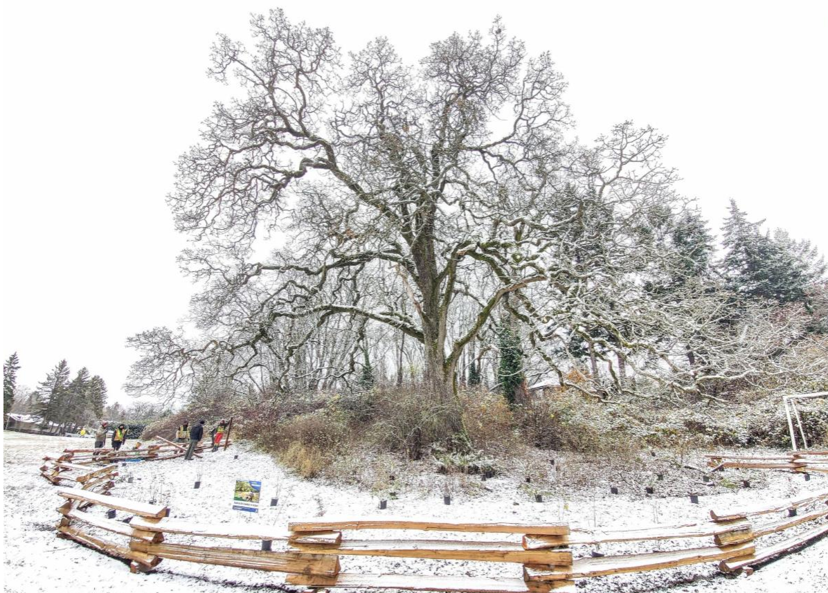
Planting a few GOMPS oaks as part of a community event at the Braefoot stewardship area in Saanich, Nov 2022.