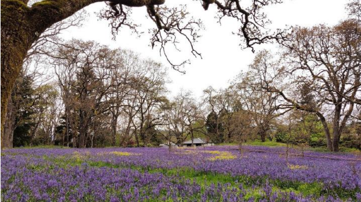
Camas meadow at Playfair Park, Saanich, BC.