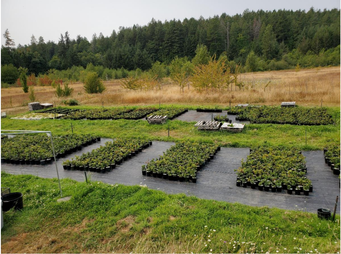
Nursery with green seedlings.

The GOMPS Volunteer Garry Oak Nursery has been in operation since 2017 to meet the challenge of producing locally sourced Garry oaks. The Nursery project is run by a task force drawn from members of GOMPS and addresses the rapid loss of Greater Victoria, Southeastern Vancouver Island & Gulf Island's native flagship tree - the Garry oak ( Quercus garryana ) - our province's only native oak.