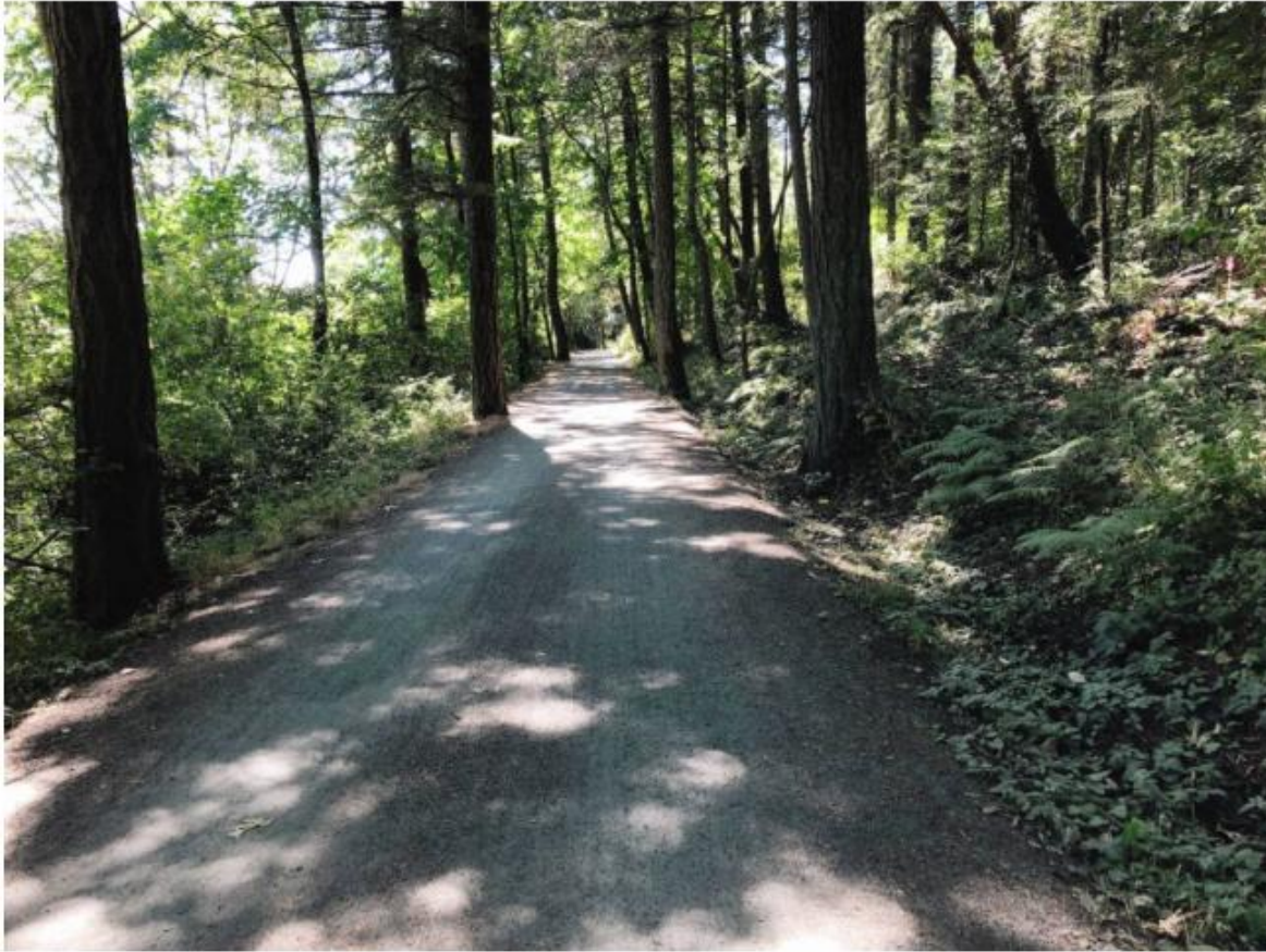
The tree canopy along a stretch of Lochside Trail in Saanich. TIMES COLONIST