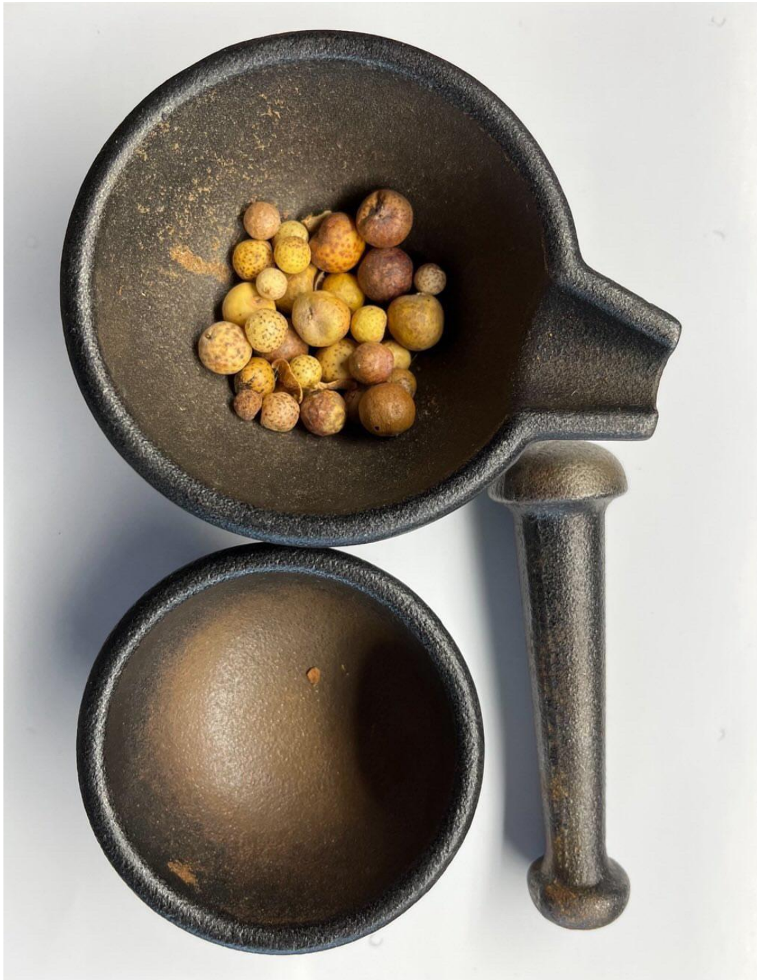
Mortar and pestal with oak galls.