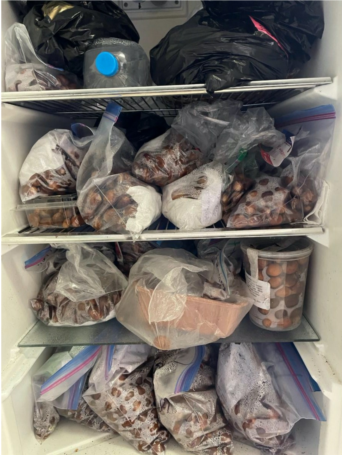
Picture of inside GOMPS nursery fridge with donated acorns.

Thank you to everyone who collected Garry oak acorns and donated them to our nursery