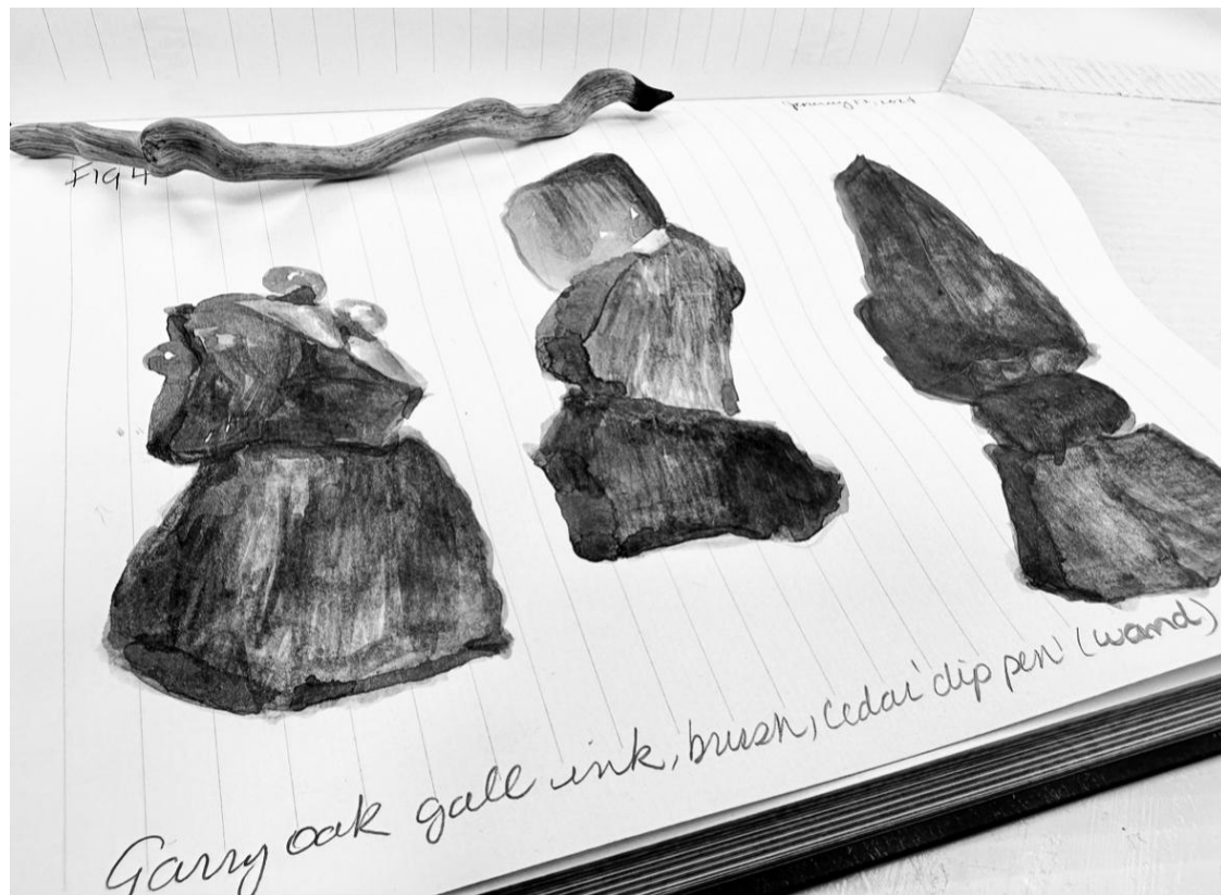
Untitled, Garry oak gall ink on paper, 2024.