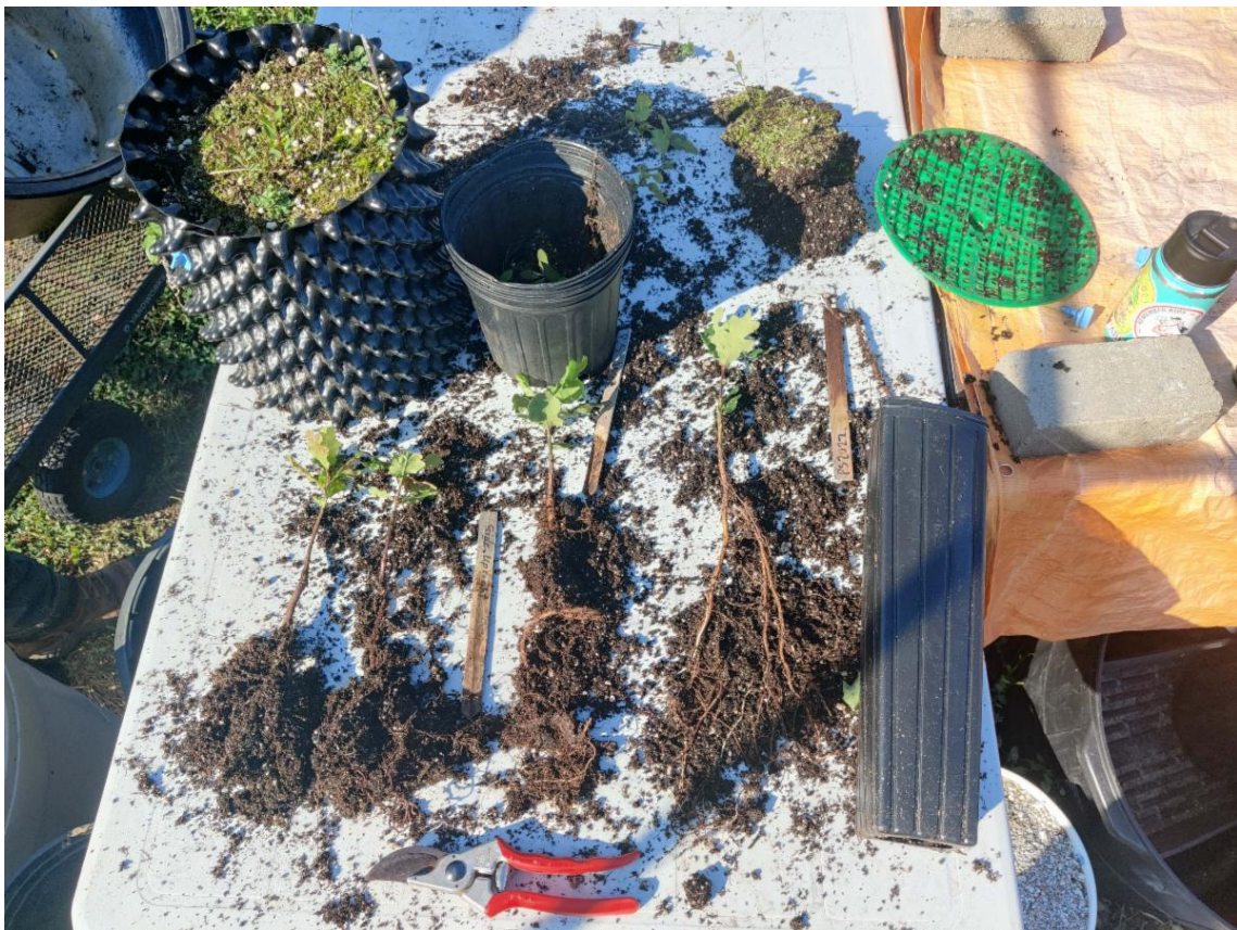
Oak seedling left to right in front of pots

An important aspect of nursery work is checking on the health of our seedlings to allow for successful transplanting. GOMPS has explored different container technology to avoid circling roots since optimal root system development is critical for anchorage and water/nutrient uptake functions of establishing trees. Trials conducted a couple of years ago indicated air pruning pots (details and link in Choosing Tree Seeds , below) were the most effective at controlling the circling defect from occurring, and for tapering vigorous taproots to distribute energy into fibrous root system development.