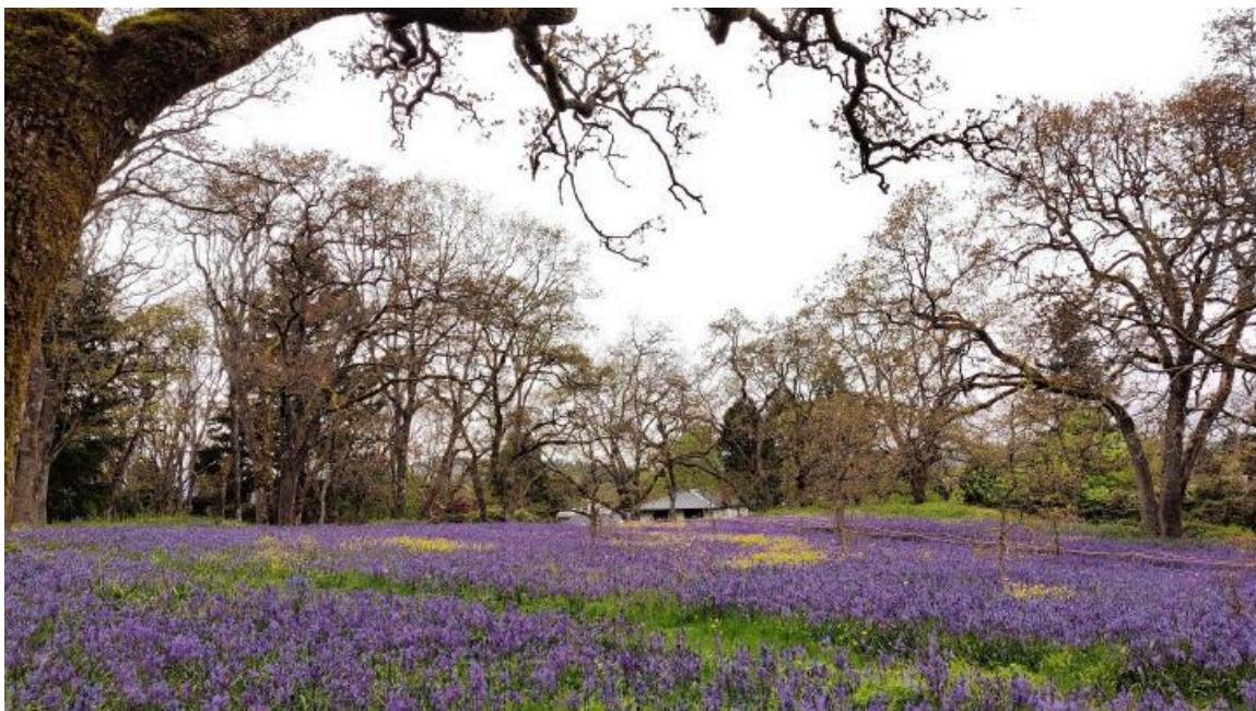
Camas meadow at Playfair Park, Saanich, BC.