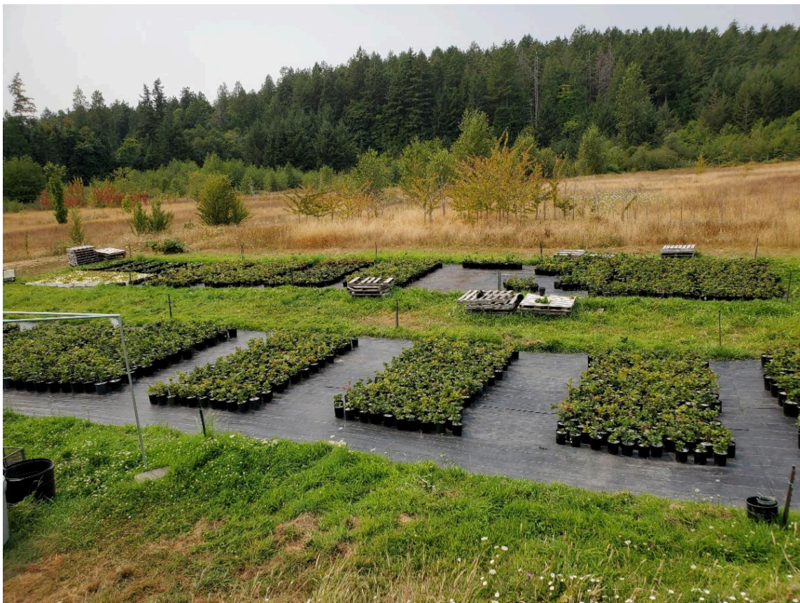
Nursery with green seedlings.

The GOMPS Volunteer Garry Oak Nursery has been in operation since 2017 to meet the challenge of producing locally sourced Garry oaks. The Nursery project is run by a task force drawn from members of GOMPS and addresses the rapid loss of Greater Victoria, Southeastern Vancouver Island & Gulf Island's native flagship tree – the Garry oak ( Quercus garryana ) – our province's only native oak.