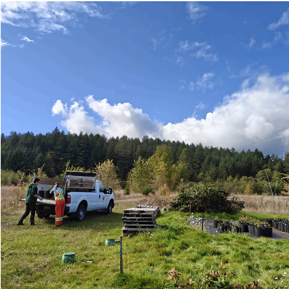
Pick up by Saanich Municipality staff. October 2025.