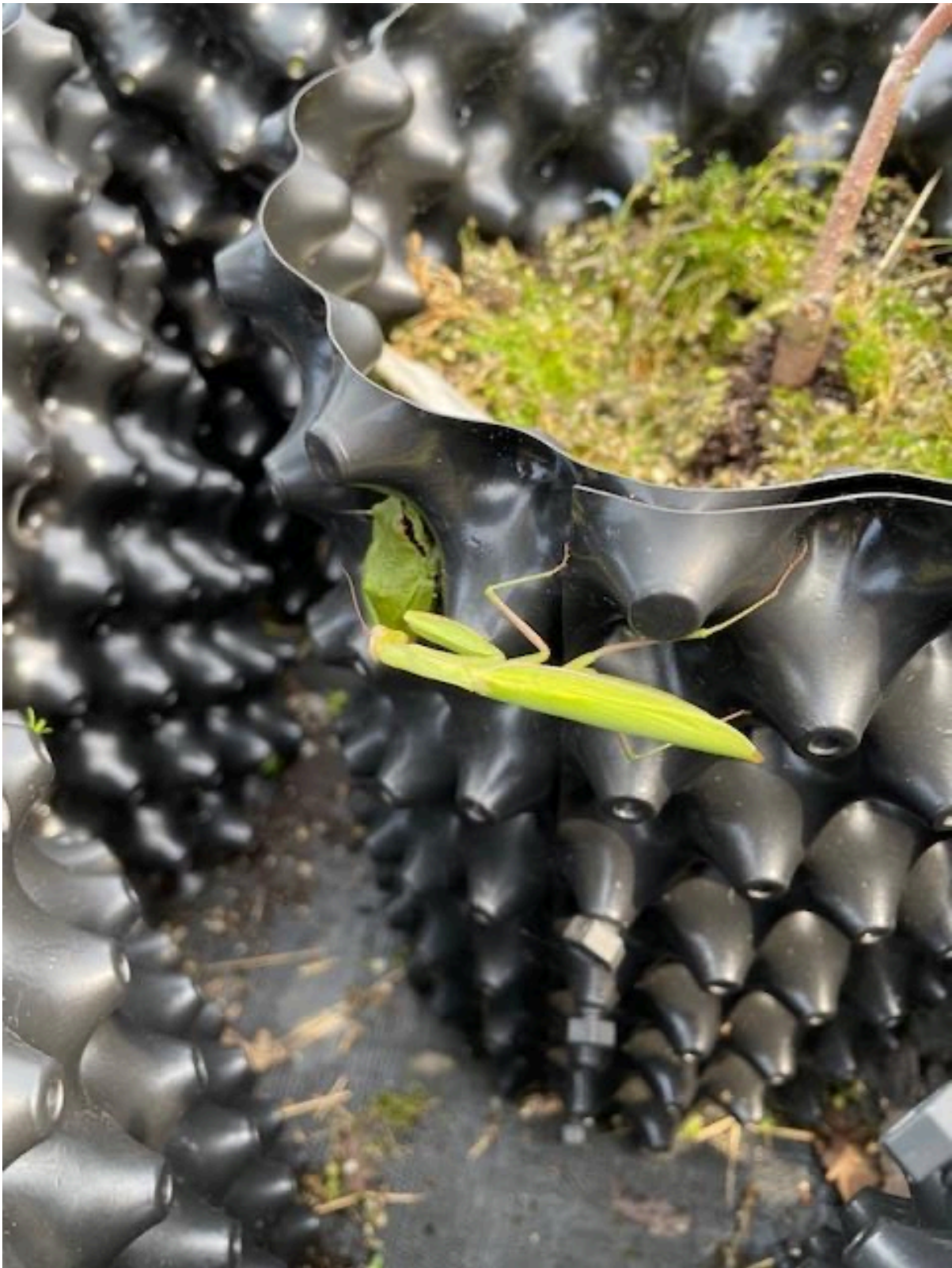
European Praying Mantis and Pacific Tree Frog. September 2025.

accomplishment! It's also wonderful to see two big new gaps on the nursery fabric—making plenty of room for our 2025 acorns!