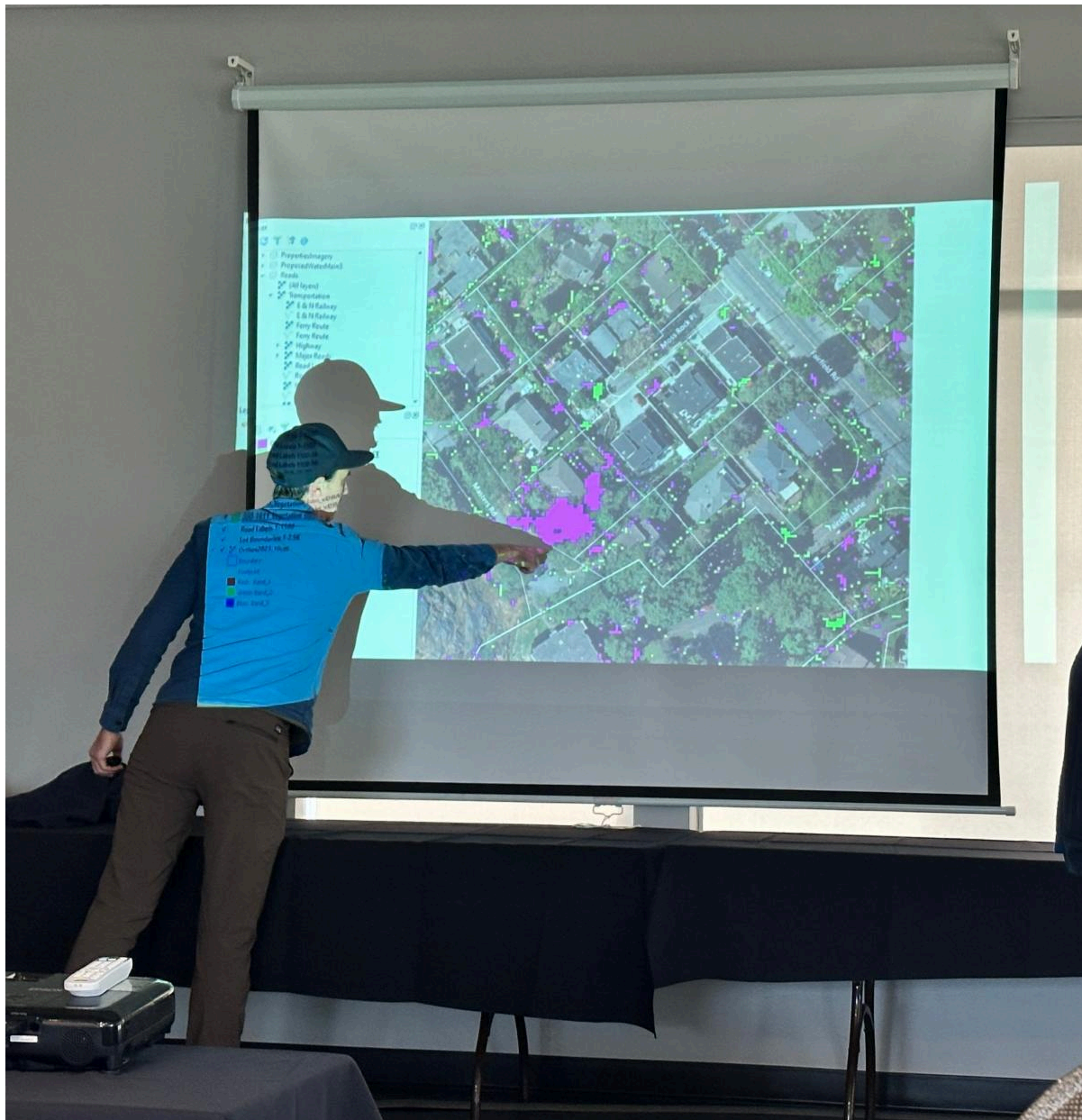
GOMPS AGM Presentation, Nov 9, 2025.