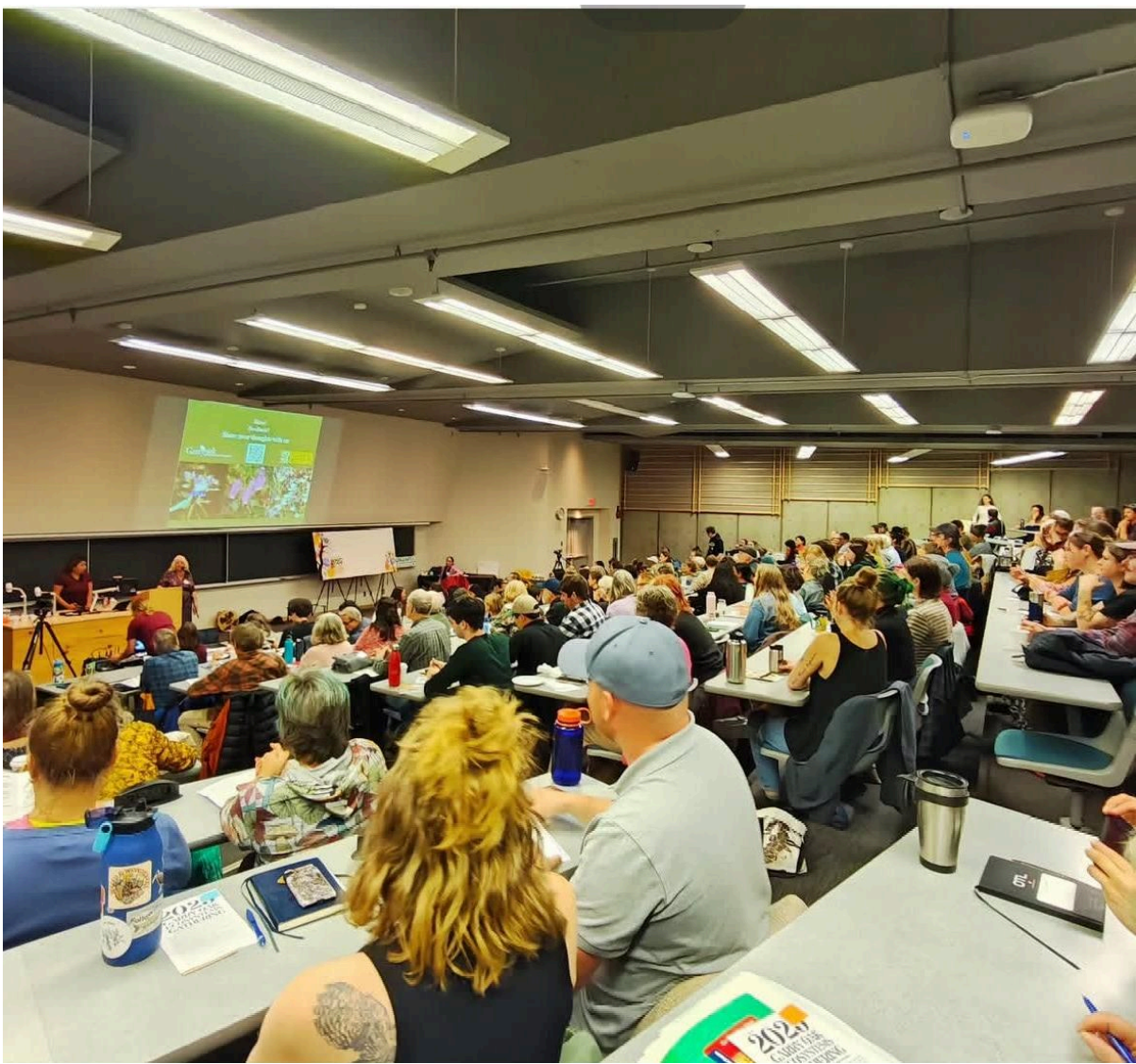
GOERT Gathering. Nov 1, 2025.