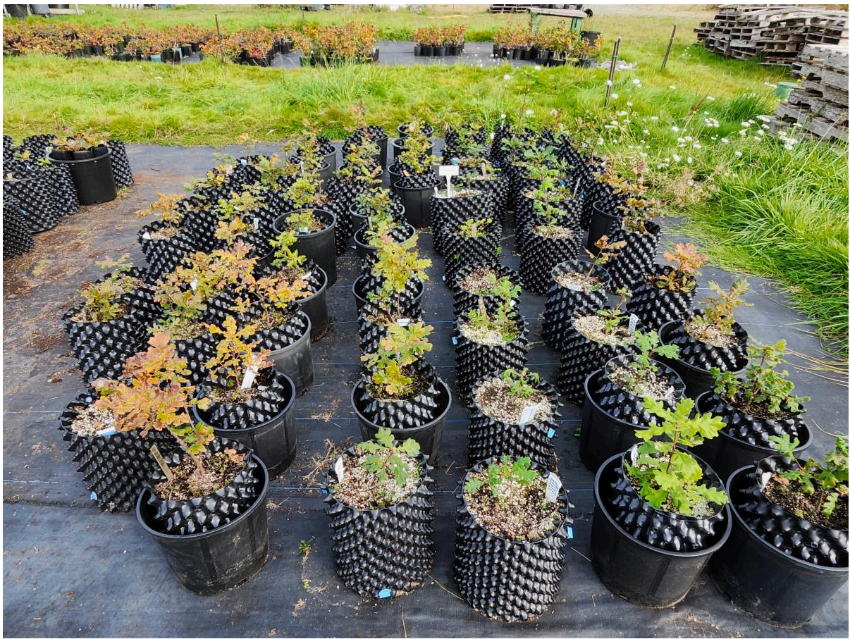
GOMPS Nursery: Garry oak seedlings ready for pickup. October 2025.