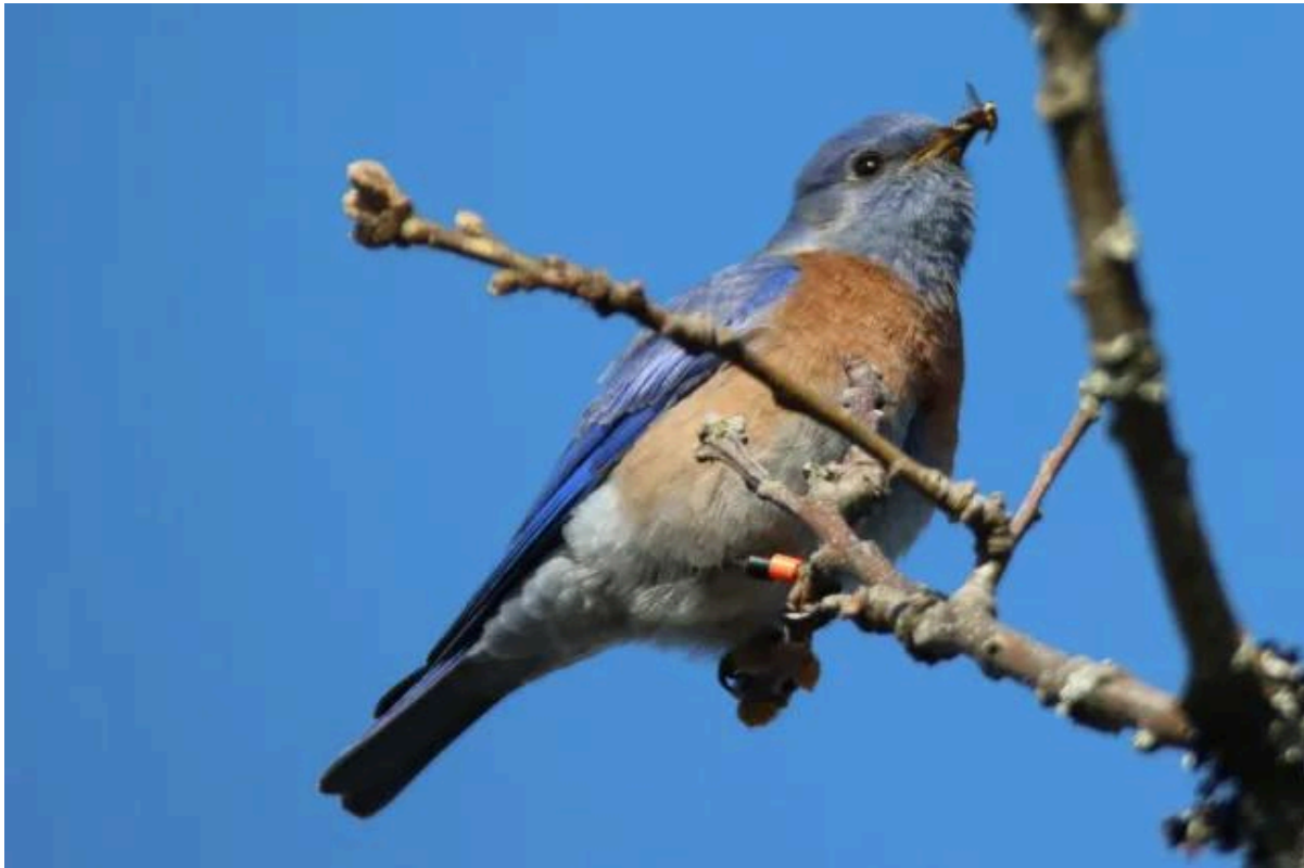
One of the Cowichan Bluebird wanderers in Victoria, BC, November 30, 2025.

https://cowichanbluebird.wordpress.com/adopt-a-nest/ or https://cowichanbluebird.wordpress.com/support/