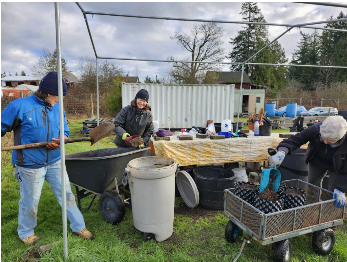
GOMPS Nursery work party, planting acorns.

We host weekly Garry Oak Nursery work parties on Sunday mornings from 10 am to 1 pm to keep our oaks growing and healthy.